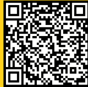
Mobile QR Code

Today’s advanced mobile hydraulic solutions require a unique blend of hydraulic system experience, motion controls expertise and the ability to seamlessly integrate them into your application. From simple manual controls to complex automated operations, we work closely with you to develop a solution that meets your performance and cost requirements.