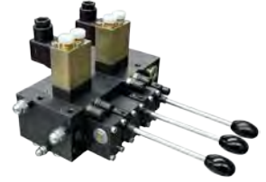
Hawe PSL Series Manual / Electro-Proportional valve.

Advanced Fluid Systems has developed custom mobile hydraulic solutions for drilling equipment, emergency vehicles, aircraft maintenance vehicles (below), marine vessels and more.