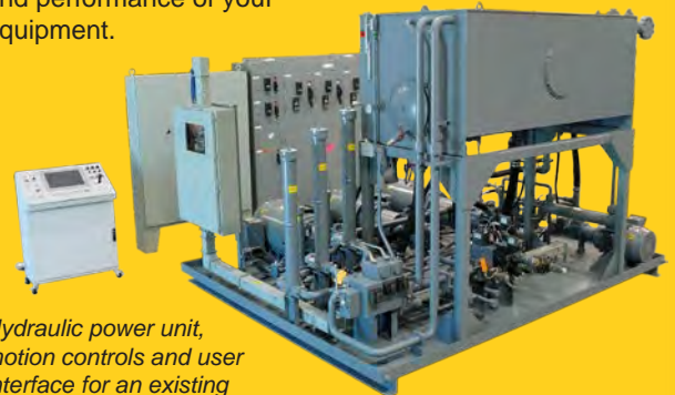
Hydraulic power unit, motion controls and user interface for an existing 500 ton press.

Upgrade your existing machine or equipment at the fraction of the cost of new, while reducing maintenance and employee operating costs. Combining high efficiency hydraulic components with user-friendly interfaces is a cost effective way to improve the life and performance of your equipment.